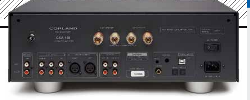
ABOVE: MM phono is joined by a tape loop, three line ins (two on RCAs, balanced on XLRs), a preamp out and single sets of 4mm speaker terminals. Digital inputs include coaxial, two optical and USB. Note hole for optional Wi-Fi/BT streaming adapter

and purposeful but entirely in keeping with the rest of the audioband. Even the gentlest of compositions, such as Nils Frahm and Woodkid's piano-laden 'Winter Morning I' [Ellis; 48kHz/24-bit] had a tangible solidity to them, and with an electronic track like Grooverider's evocative 'Where's Jack The Ripper?' [Mysteries Of Funk; Higher Ground HIGH6CD], it lapped up the deep dives and midrange snarls.