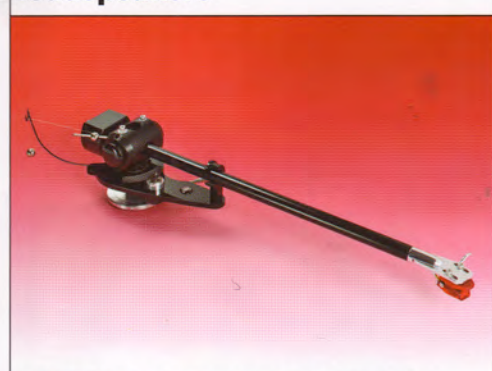
ORIGIN LIVE ENCOUNTER MK.3c tonearm exclusive!