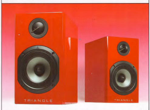
TRIANGLE COLOR loudspeakers