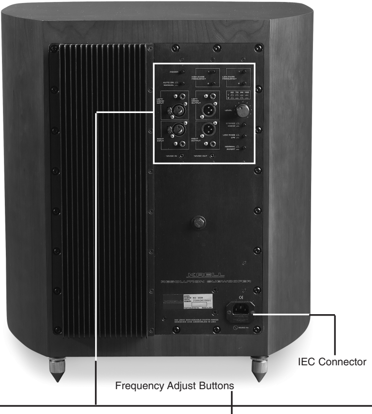
Figure 1 Resolution Subwoofer Back