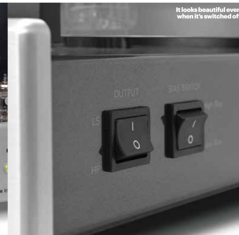
It looks beautiful even when it's switched off