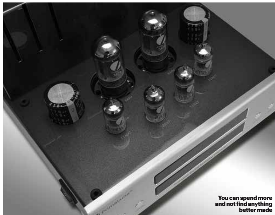
You can spend more and not find anything better made