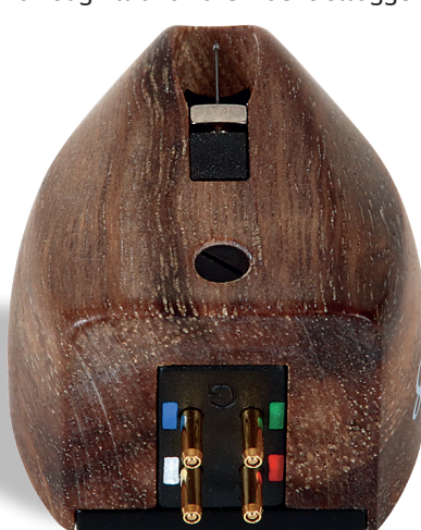
ABOVE: The chestnut shell is bolted onto the N°8's alloy body via a small screw. The colour-coded pins are well spaced and easily accessible

Then again, this LP featured the magnificent Steve Vai, and guitar is what it's all about. The N°8 seems to know this. Coverdale's singing, a paradigm of Plant/Tyler/Roth crotch-rock grandeur, comes through with all the macho swagger